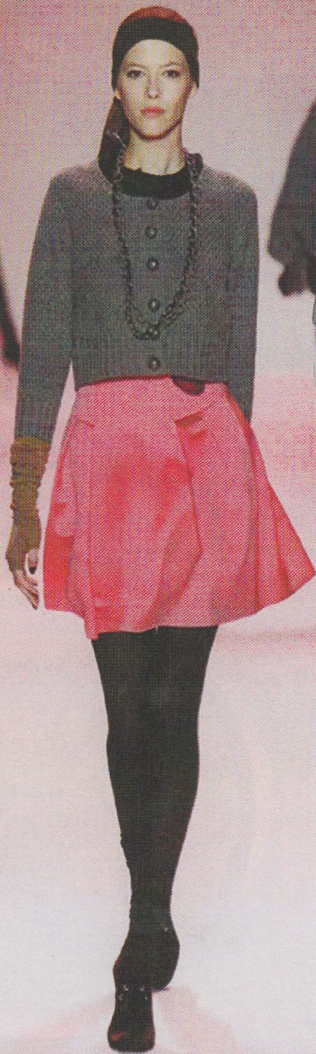
Milly Fall 2009 Collection